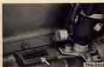
270 AND 302

Always refer to serial numbers of chassis and engine, and model numbers of other units (transmission, distributor, etc.) when ordering parts or requesting service information.